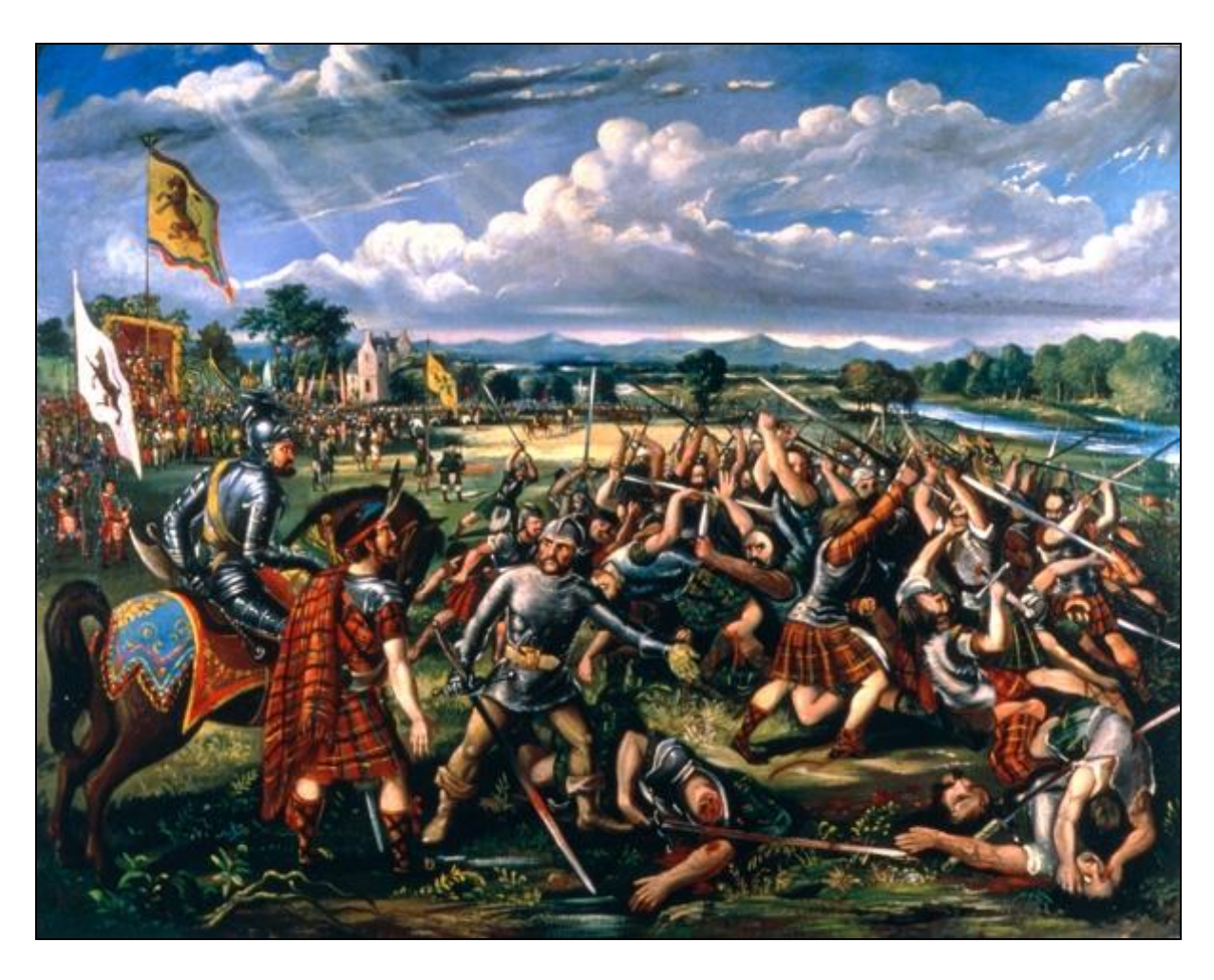
The Battle of the Clans, oil on canvas by an unknown artist of The Scottish School, 19th century © Perth Museum and Art Gallery, Perth & Kinross Council, Scotland.

Not for sale, free download available from www.reynoldmacpherson.ac.nz